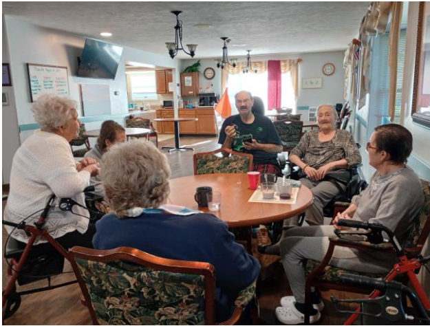
The residents enjoying some coffee and social time